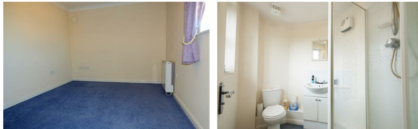
GROUND FLOOR 679 sq.ft. (63.1 sq.m.) approx.